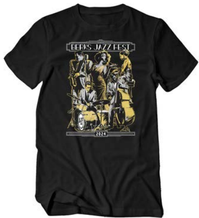
SHORT-SLEEVED SHOW T