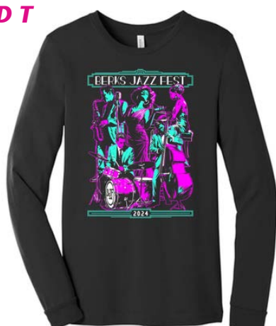
LONG SLEEVE T