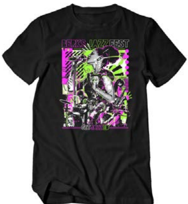
SHORT-SLEEVED GETJAZZED T