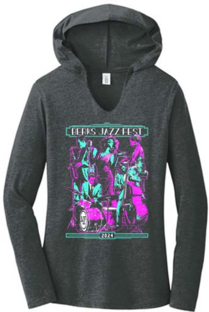
WOMEN'S SHOW HOODIE