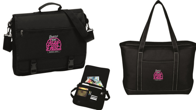
MESSENGER & TOTE BAGS